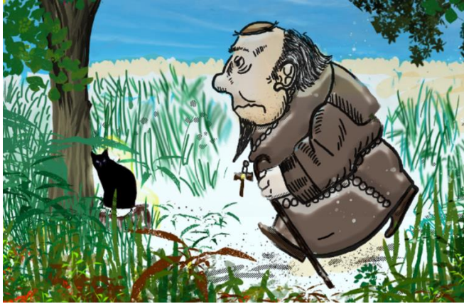
The Cat and The Friar

Public Service Ad: Safe Haven Baby Box . Start one in your area and let us know about it: tradeview@neo.rr.com